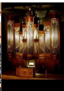
new organ by Garnier