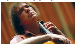
Principal, Julian Lloyd Webber