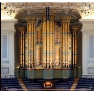
Victorian splendour at Town Hall