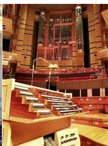
iconic Klais at Symphony Hall