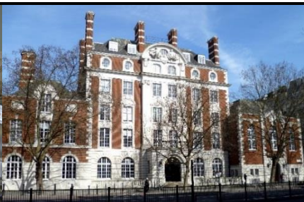
Royal Academy of Music, NW1

TEENAGERS KEEN TO PURSUE THEIR ORGAN PLAYING THROUGH HIGHER EDUCATION WILL WELCOME THIS DAY-PROGRAMME WHICH FLINGS WIDE THE DOORS OF THE ROYAL ACADEMY OF MUSIC.