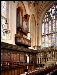
Winchester College. Hants.