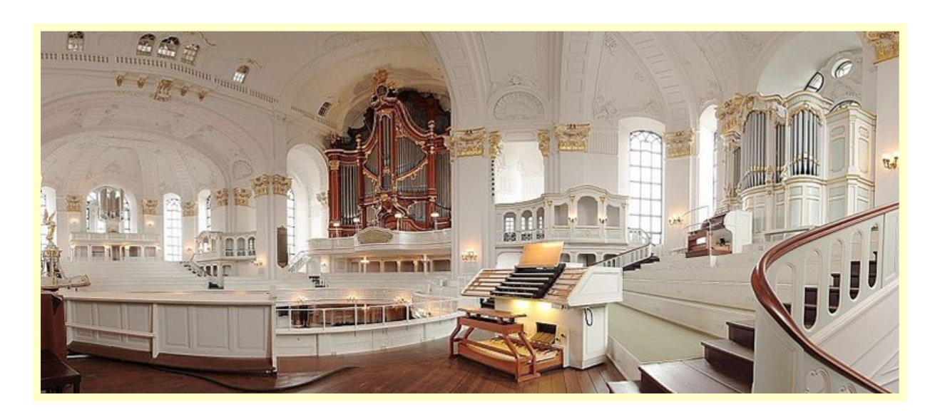
grand console, Michaeliskirche, Hamburg